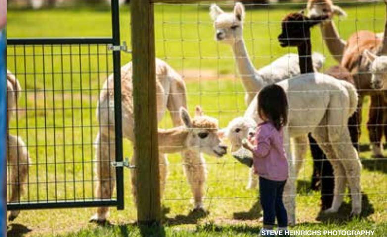
STEVE HEINRICH'S PHOTOGRAPHY

Find other Oregon Food Trails at oregonfoodtrails.com .